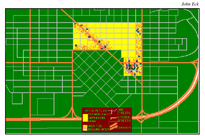
This graphic depicts an arterial street in an economically depressed area with high risk dealing areas denoted by the boxes and dots.

Operations . Closed markets require fewer employees because the volume of buyers is smaller and the dealer wants to avoid open advertisement of the market. Some closed markets in apartment complexes operate only in evening hours, perhaps indicating the dealer is legally employed during the day or is simply minimizing risk by limiting hours.