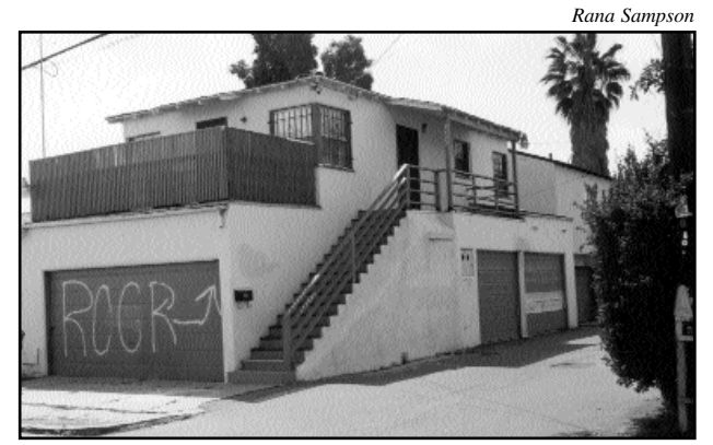
This open drug market in a small apartment complex is one block off a main street with both street and alley access easing entry and escape. While most open markets use street dealers as their billboard, others, like this one, are more brazen.

Dealer security. Operating off the public street on apartment complex grounds gives dealers an advantage: they can see if police are coming, and can escape into the security of a specific apartment where officers cannot enter without a warrant or a constitutionally recognized exception.