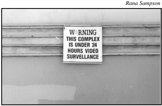
A property owner on a high-risk block affixed this sign to deter potential offenders from the location.

If the owner's profits from the property are so low that it is financially impossible for the owner to wait to find a screened tenant, then applying pressure to the owner will not help. In