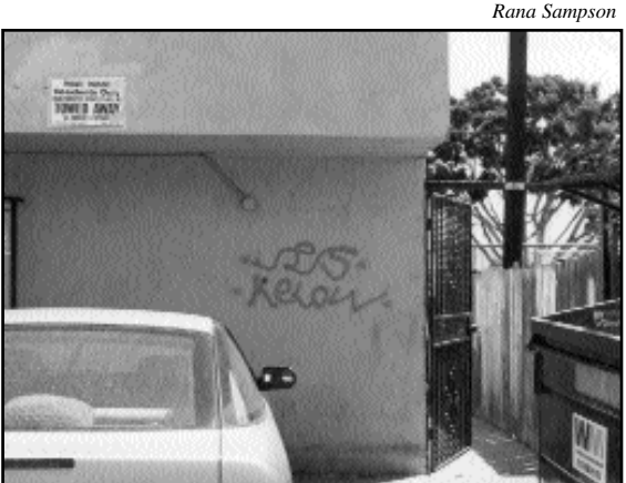
This apartment complex is at high risk for dealing. It is on a block that has had drug markets, is off of an arterial street, backs onto an alley providing multiple entries and exits, is tagged "Kelow," (probably purposefully misspelled), its alleyside security gate is propped open, and the dumpster is propped open offering an easy hiding place for stash. While a "Residents Only" parking sign is visible, the owner must do more to prevent nearby markets from displacing to this complex.

§ For a more detailed discussion of displacement and drug markets, see Jacobson (1999).