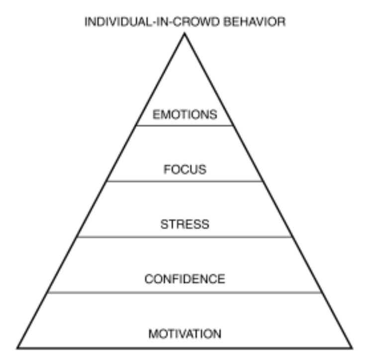
Figure 3. Potential points of intervention for control of individuals.

Police have found it more effective to target the individual(s) engaged in violent behavior and to respond to that behavior, rather than the crowd as whole.