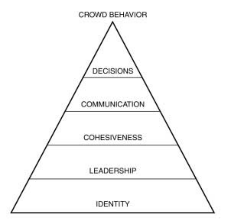
Figure 4. Potential points of intervention for the control of crowds.

To provide a framework for tactical commanders in negotiations, Dr. Taylor provided another model for crowd behavior. Similar to the individual model, this crowd model is also a pyramid, comprised of five group factors, which follow a logical and purposeful progression.