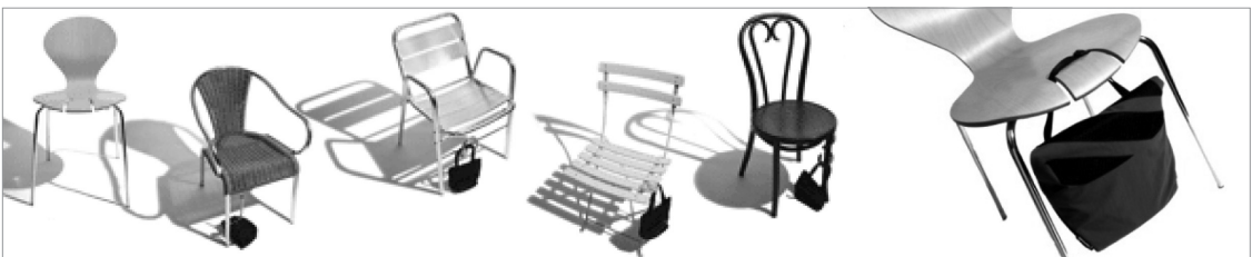
Examples of anti-theft furniture.