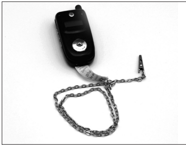
Example of a lanyard.

Other examples include personal table clips that customers can carry with them for use at any location, and solutions that aim to camouflage or conceal valuable items such as laptops. Although police agencies are unlikely to distribute or endorse these products, educating the public about their existence may be helpful.