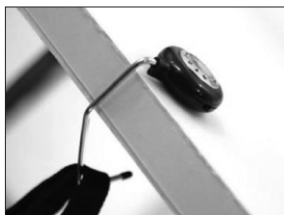
Example of a portable bag clip that attaches to a table.