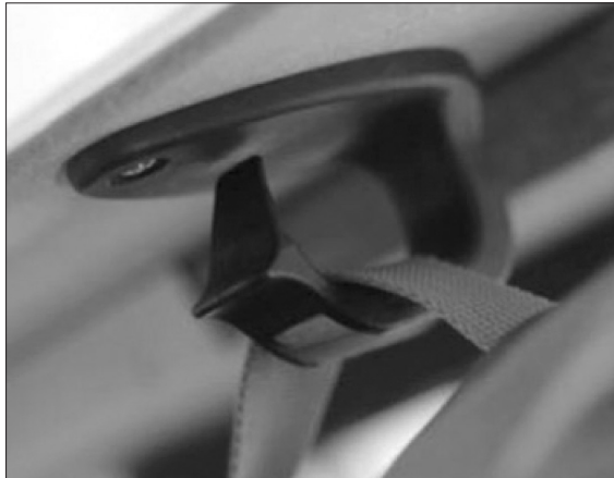
An example of a Chelsea clip which can be attached underneath tables to secure customers' bags.

Major coffee shop chains and fast food outlets have shown interest in design solutions such as bag clips and anti-theft furniture, but, at the time of writing, are not yet using them.