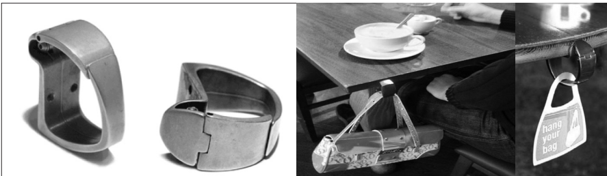
Examples of alternative table clips.