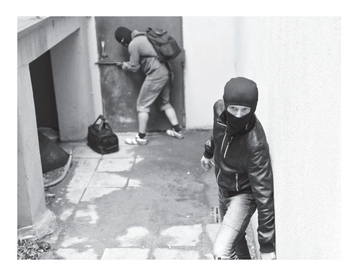
Most home invasions are committed by groups of young men.

In general, victims report home robberies to the police more frequently than street robberies.<sup>55</sup> However, there are several reasons why they might not: victims either are involved in crime, fear repeat victimization or retaliation, or distrust police.<sup>56</sup>