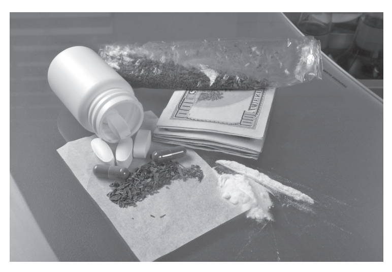
Many home invasion robberies are drug rip-offs in which the drugs or cash are the target.

Yet, home invasion robbery is distinct from these crimes.<sup>2</sup> Street robbery occurs in public or quasi-public space and victims are pedestrians, not occupants. Most residential burglars try to avoid confrontation, but home robbers seek it. Residential burglars who confront and rob unexpected occupants are not necessarily home robbers, because they did not intend to commit robbery when they entered the home.<sup>3</sup>