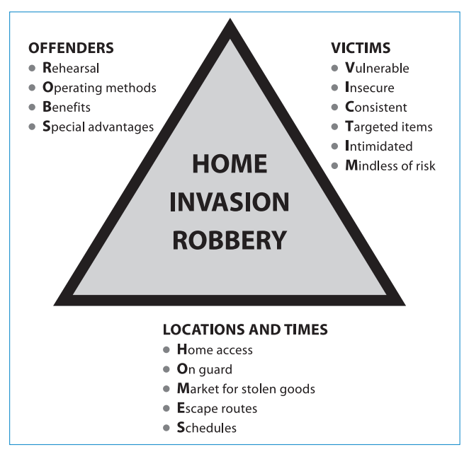
FIGURE 1. Home Invasion Robbery Analysis Triangle

The relative importance of each side of the triangle varies, depending on the details of a home invasion robbery problem. Addressing any one element in Figure 1 might reduce a robbery problem, but addressing more than one element may be more promising for achieving a decline. The sections below describe each factor in more detail.