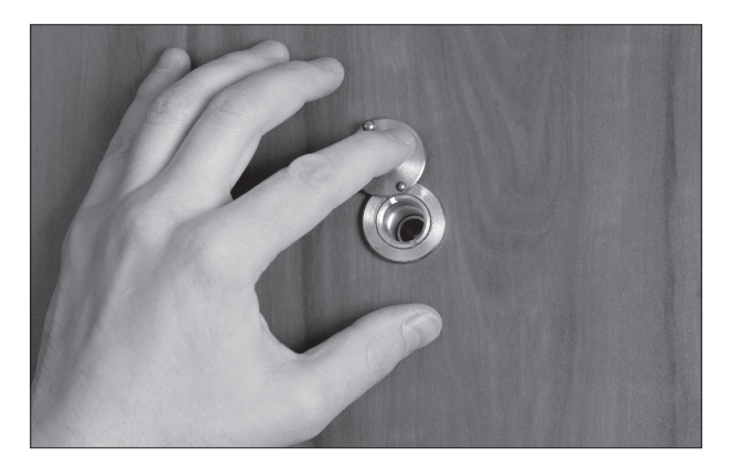
Door peepholes can help prevent home invasions.