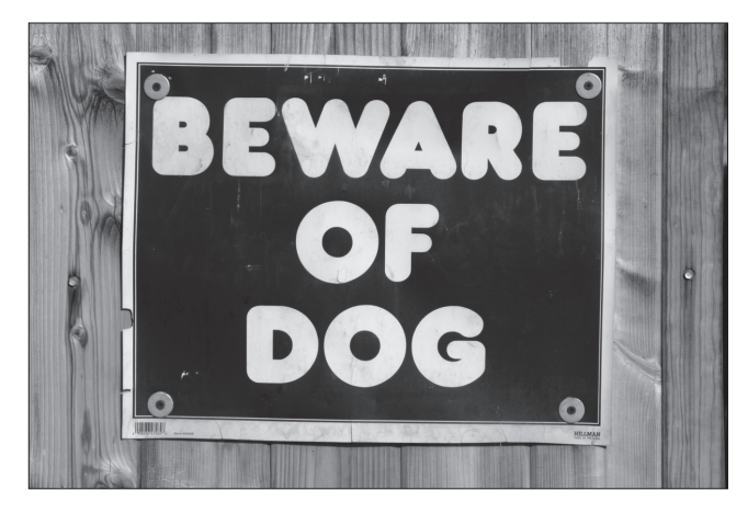
Clear indicators that dogs are in a home can deter home invasions.